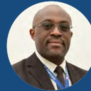
Babafemi Dada Governor HMP Featherstone