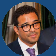
Raphael Rowe Investigative Reporter, Panorama, Netflix, The One Show