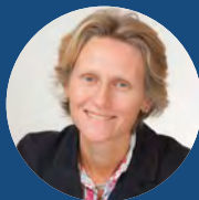
Penelope Gibbs Transform Justice, Author of 'Reframing Justice'