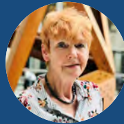
Dame Vera Baird Victims Commissioner